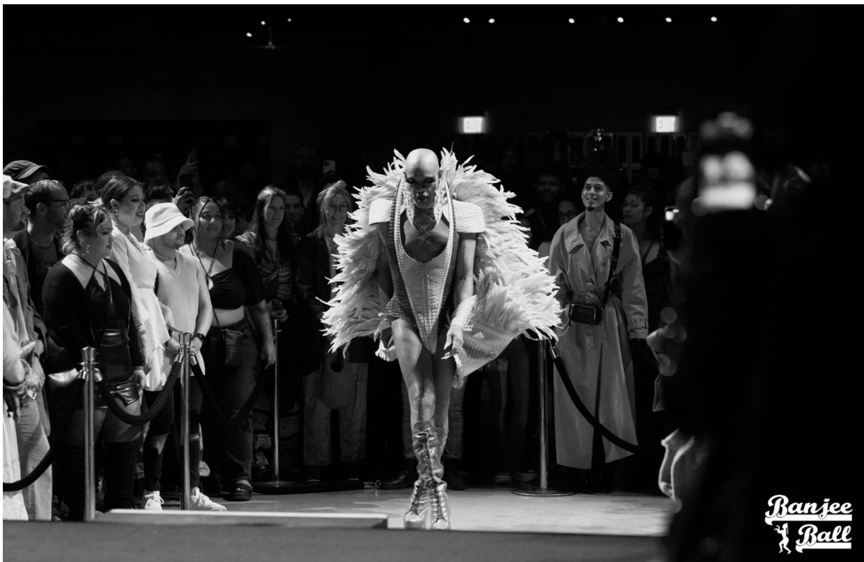
Nine Lives Banjee Ball Anniversary Ball (2022). Performance documentation from NeueHouse.