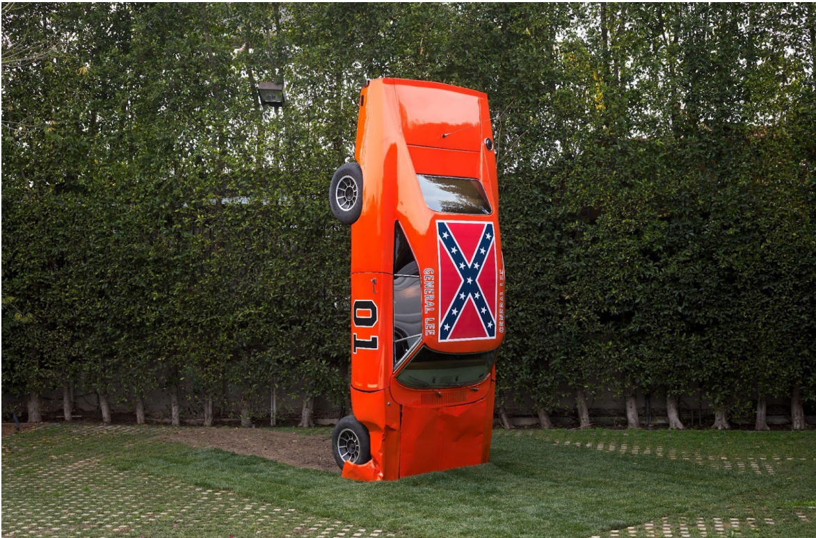
Hank Willis Thomas, A Suspension of Hostilities , 2019, Dodge Charger, 178 x 76 5/8 x 55 in. (452.1 x 194.6 x 139.7 cm). Courtesy of the artist and Pace Gallery © Hank Willis Thomas, courtesy Pace Gallery