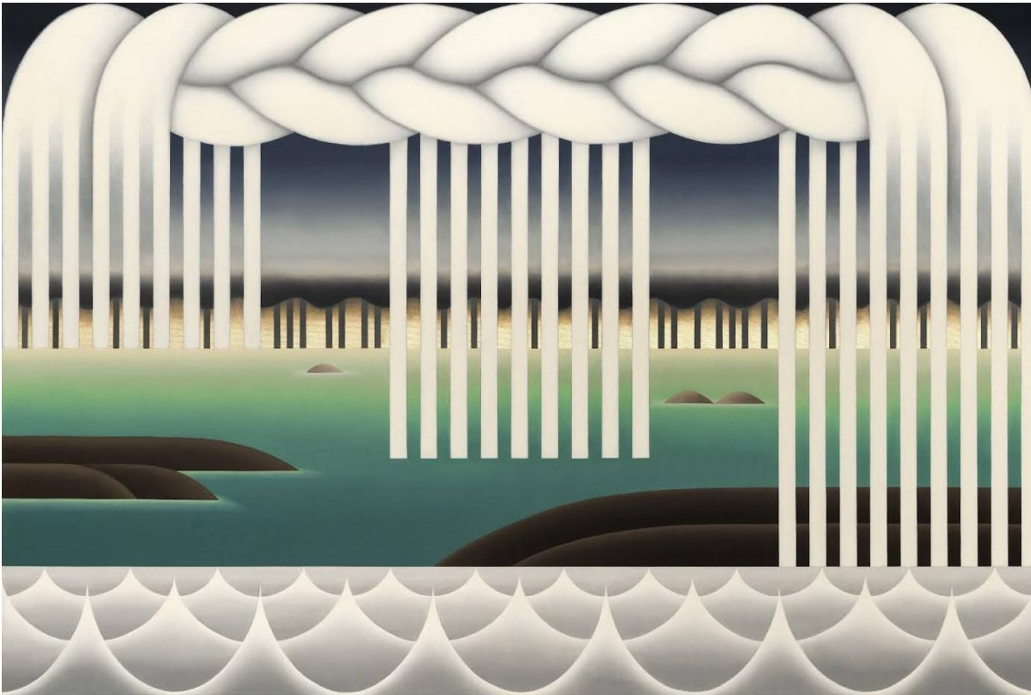
Takako Yamaguchi, Procession , 2024, oil and metal leaf on canvas, 40 × 60 in. (101.6 × 152.4 cm).