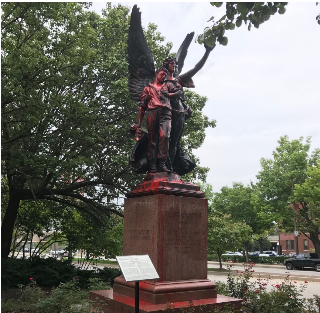
Red paint splashed on statue, Confederate Soldiers and Sailors Monument, Mount Royal Avenue, Baltimore, MD. Baltimore Heritage from Baltimore, MD, USA, CC0 , via Wikimedia Commons. Photograph by Eli Pousson, 2017 August 14.

Additional highlights include Diary of Flowers: Artists and their Worlds , an exhibition exploring how artists construct imaginative and personal networks; Tracing Performance, Fictions of Display , showcasing collection works that consider the relationship between objects, theater, and performance; and the U.S. debut of Wael Shawky's acclaimed Drama 1882 .