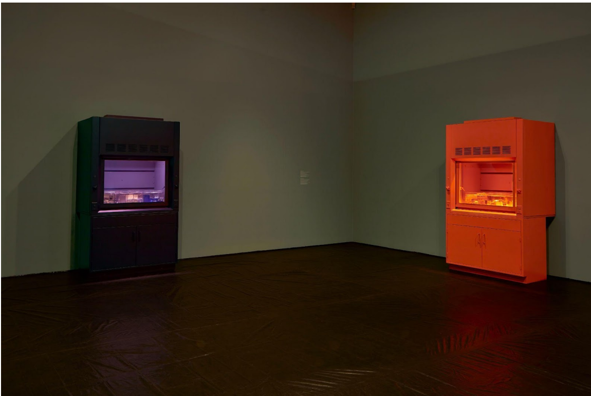
Installation view of Josh Kline: Climate Change , June 23, 2024-January 5, 2025.