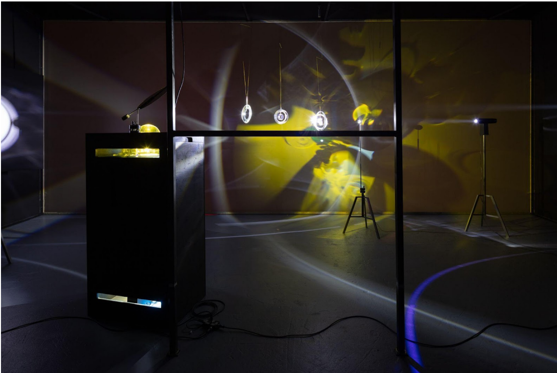
Installation view of Olafur Eliasson: OPEN , September 15, 2024–July 6, 2025 at The Geffen Contemporary at MOCA.