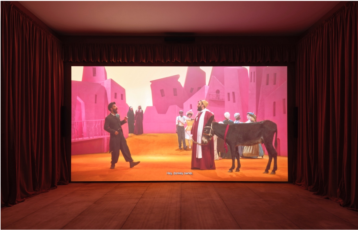
Wael Shawky, Drama 1882 , 2024 © Wael Shawky. Courtesy of Sfeir-Semler Gallery, Lisson Gallery, Lia Rumma, and Barakat Contemporary