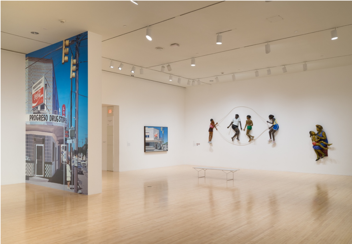
Installation view of Ordinary People: Photorealism and the Work of Art since 1968, November 23, 2024–May 4, 2025 at MOCA Grand Avenue.